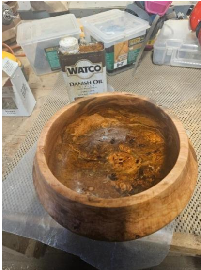
Finished cherry burl bowl

I am always amazed with how eager people in CVW are to share their knowledge, skills and time. I have worked too many places where people didn't want to share their knowledge because they didn't want anyone to be able to do the things that they do. This group is just the opposite. Everyone is very open, shares their knowledge, skills and experiences and works to make others better woodturners.