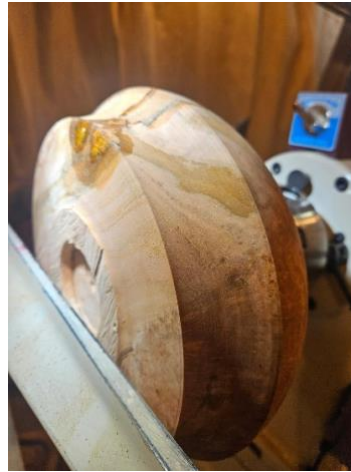
Roughed out cherry burl