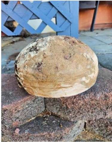
Early turning of cherry burl

A Registered Chapter of the American Association of Woodturners