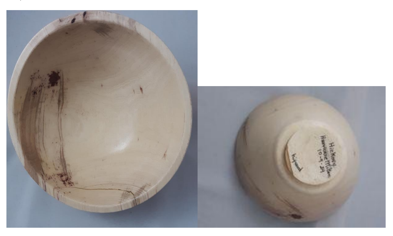
Dennis Hippen Wood is Hickory from a downed tree due to Hurricane Milton. Nice purple color in wood

Dennis Hippen Wood is Hickory from a tree felled by Hurricane Milton. Purple streaks are nice