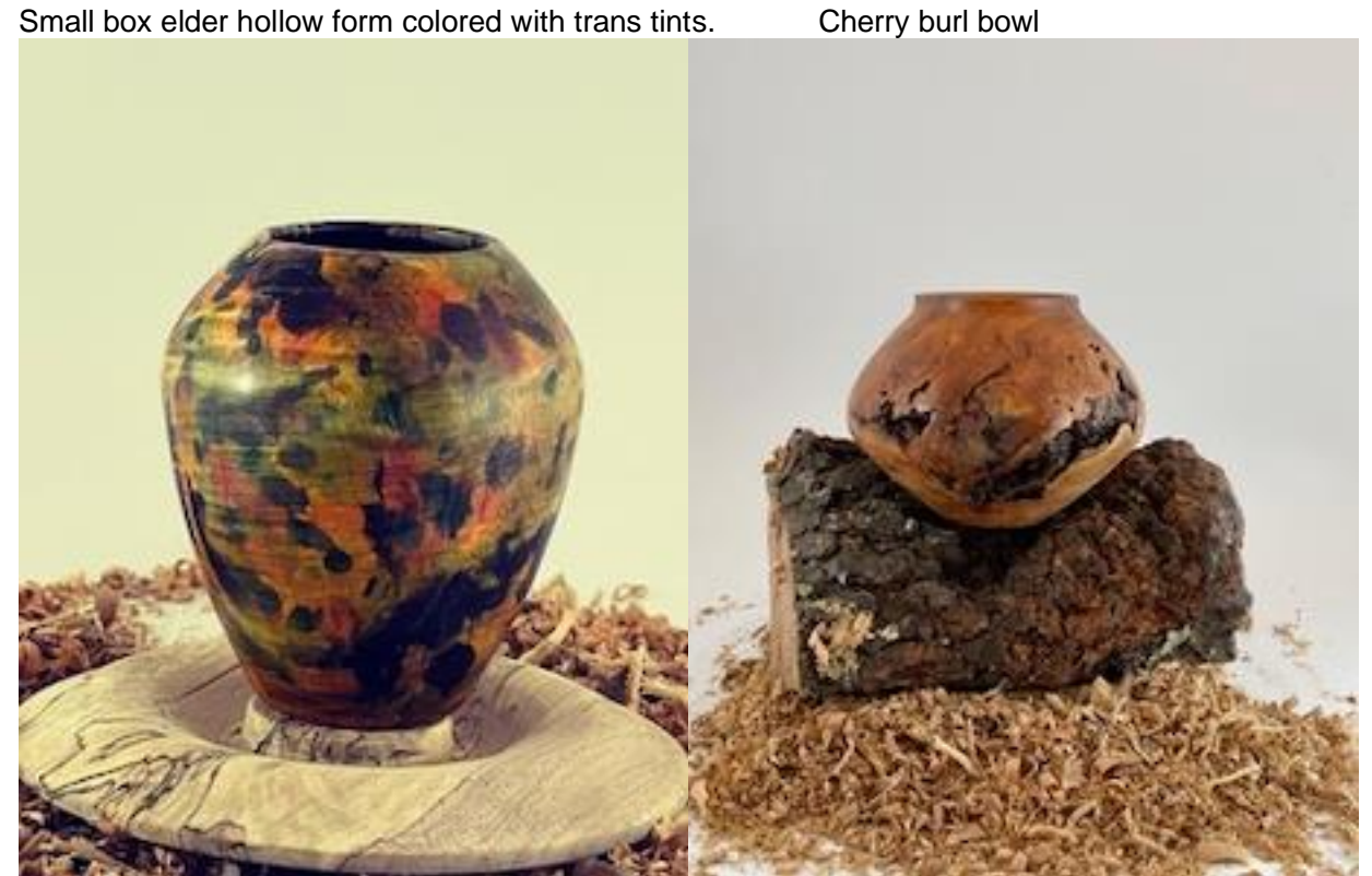
Catalpa hollow form colored with trans tints