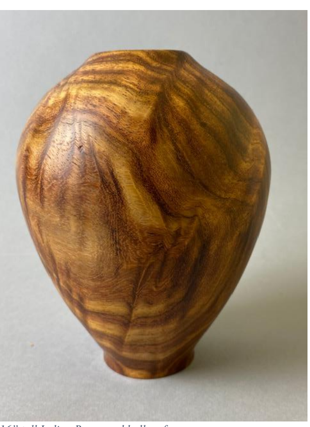
16" tall Indian Rosewood hollow form