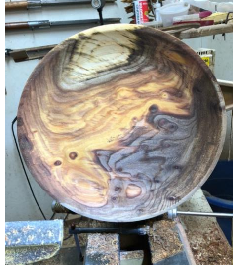
Siberian elm platter left over after cutting slabs.