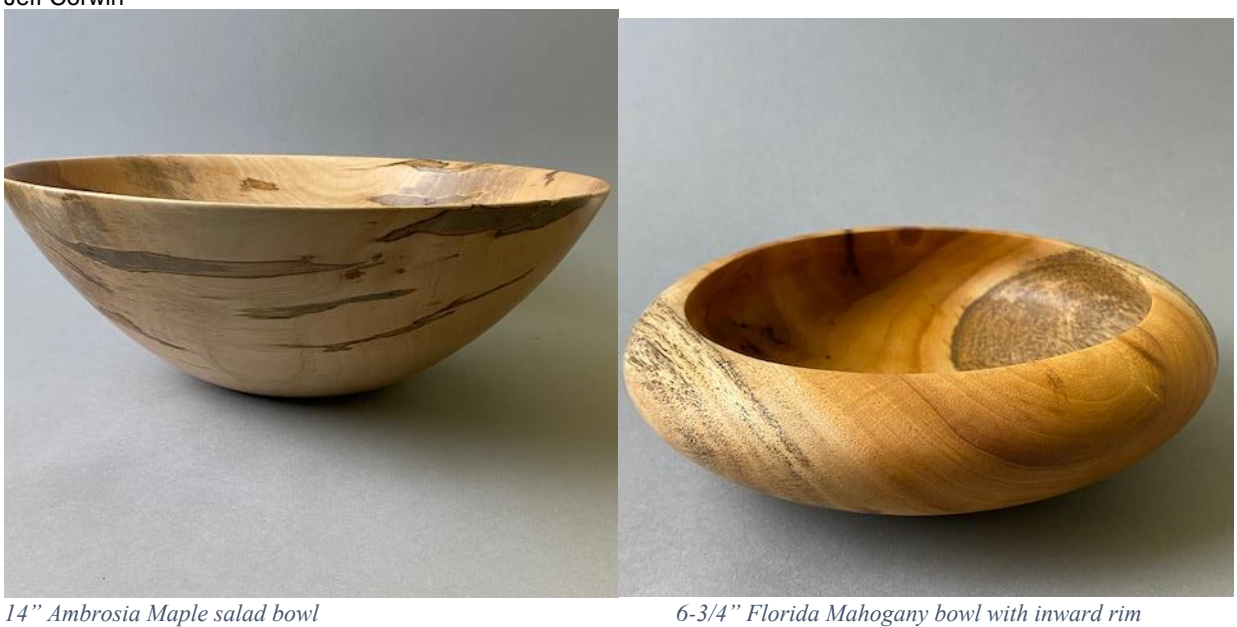
14" Ambrosia Maple salad bowl