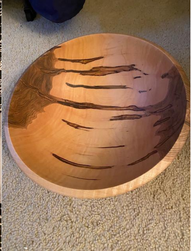
13" ambrosia maple salad bowl