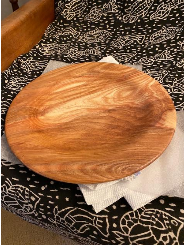
Jeff Corwin 10" ash plate