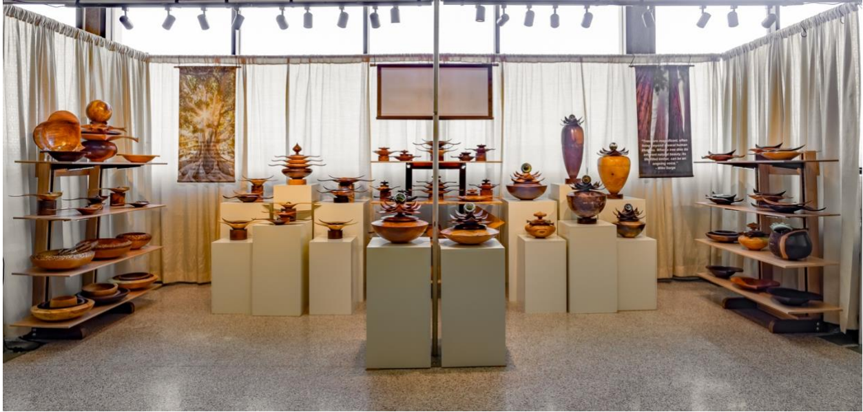
Red Oak Burl and Wenge Blossom Sculpture with Glass Orb Topper (new one)

July 2022 Southern Highlands Craft Guild Show Booth Photo