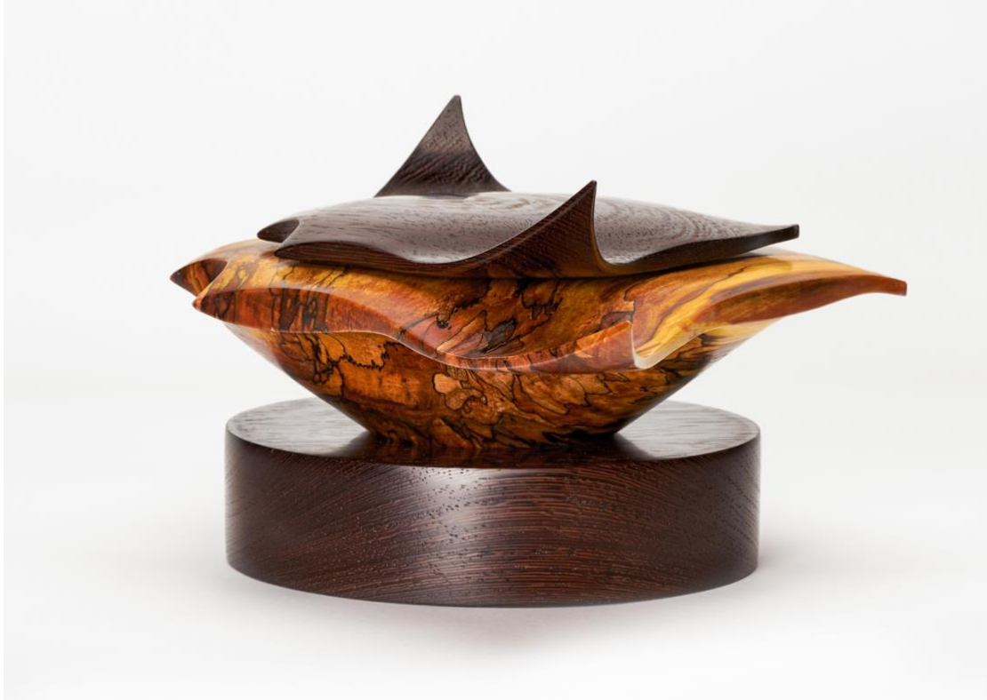
Spalted Sugar Maple and Wenge Manta Ray Box (also new one)

A Registered Chapter of the American Association of Woodturners