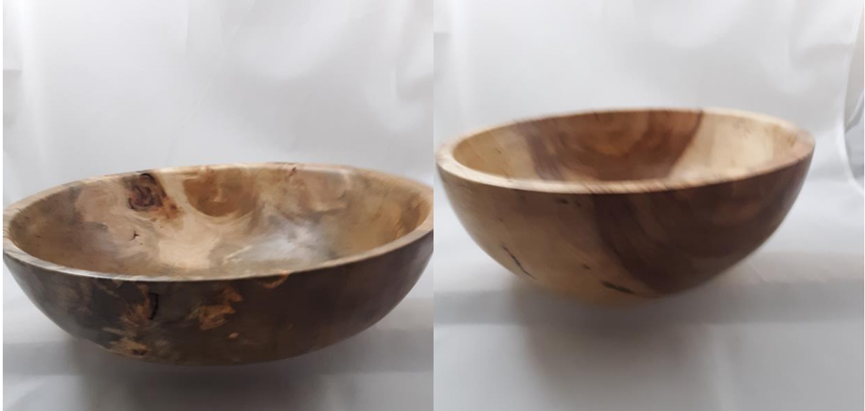
CarrotWood from Florida gulf coast -lots of knots and fun colors

Some new bowls - all are 10--11" diameter range. All from other states.