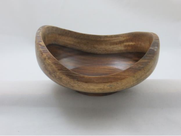
Indian Rosewood Natural Edge Bowl. Fun color contrasts. (5" W X 3" H)