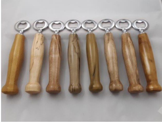
Beverage anyone???? Bottle openers are all from Monticello woods.