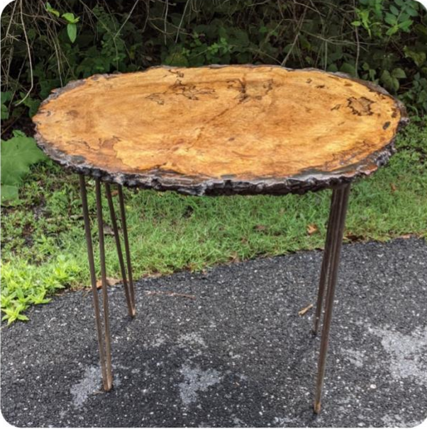
Buck Carver Natural Edge Oak Table