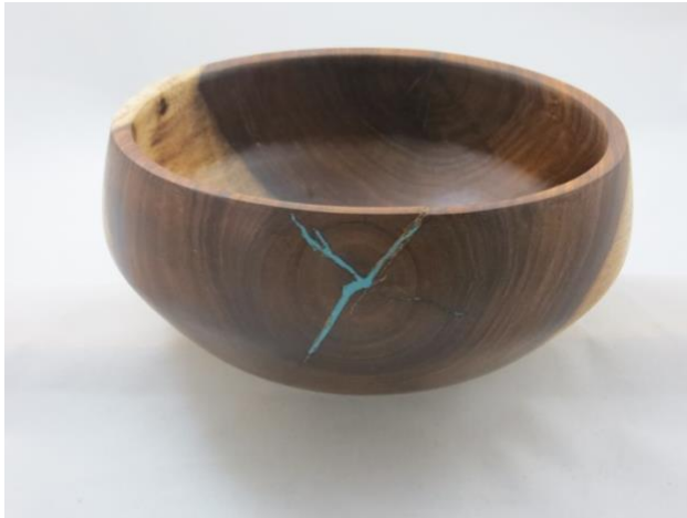
Indian Rosewood Natural Edge Bowl. Fun color contrasts. (5" W X 3" H)