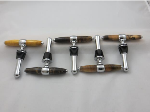
MTP and 1 JMM Handled corkscrew/bottle stopper opener. Wine anyone?