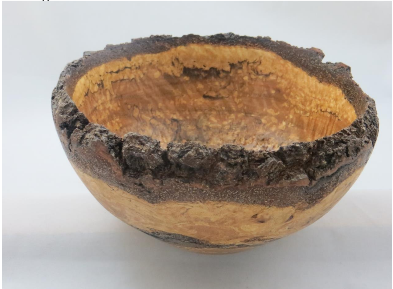
Red Oak Burl David Pence. Photo of a commission job bowl from a Red Oak bowl with big bark on. ( 8" W X 5" H )