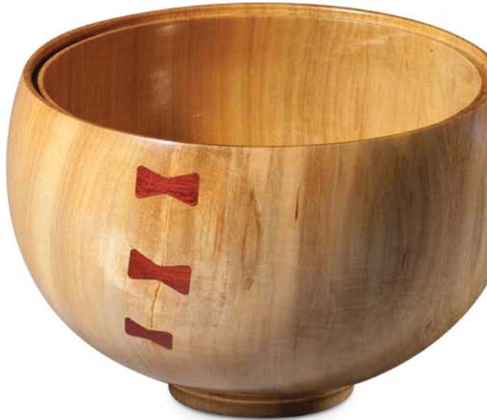
Dennis Belcher , Resurrection Series , 2010, Mineralized soft maple, padauk, 5" × 7" (13cm × 18cm)