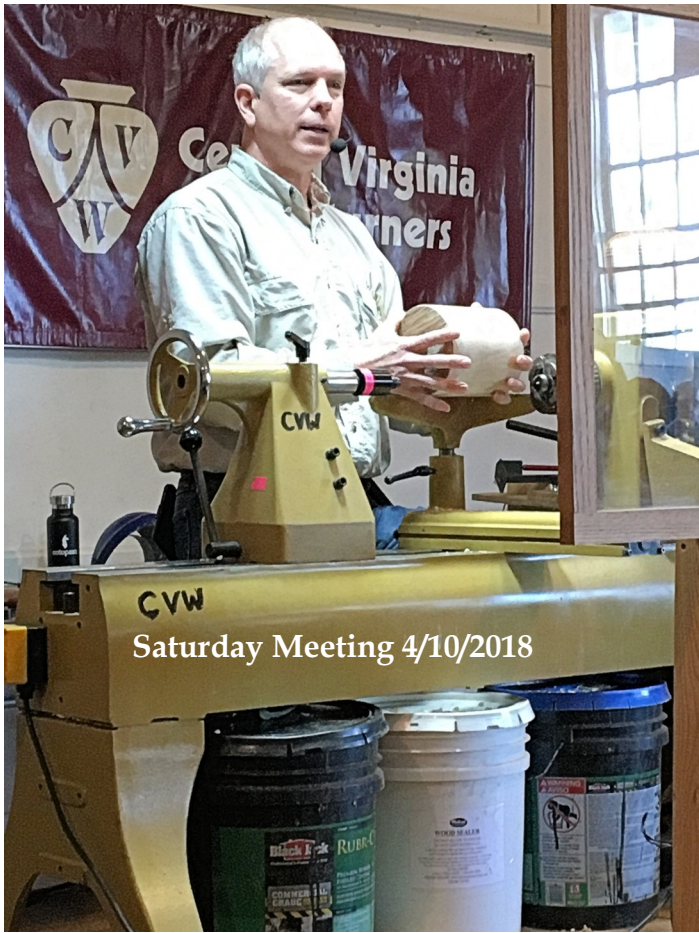
Saturday Meeting 4/10/2018