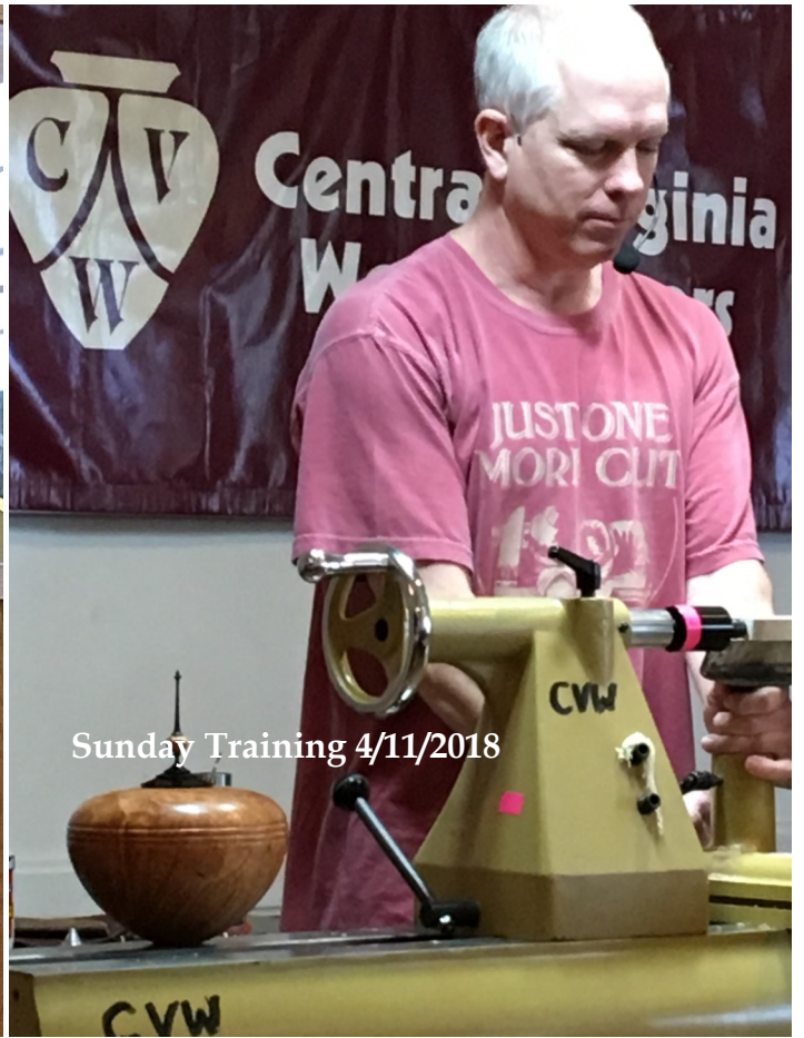
Sunday Training 4/11/2018