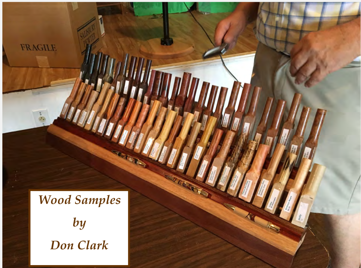
Wood Samples by Don Clark