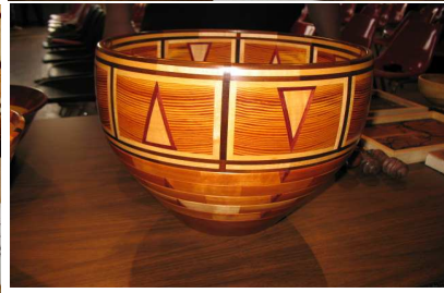
Jim Sprinkle Segmented Bowls