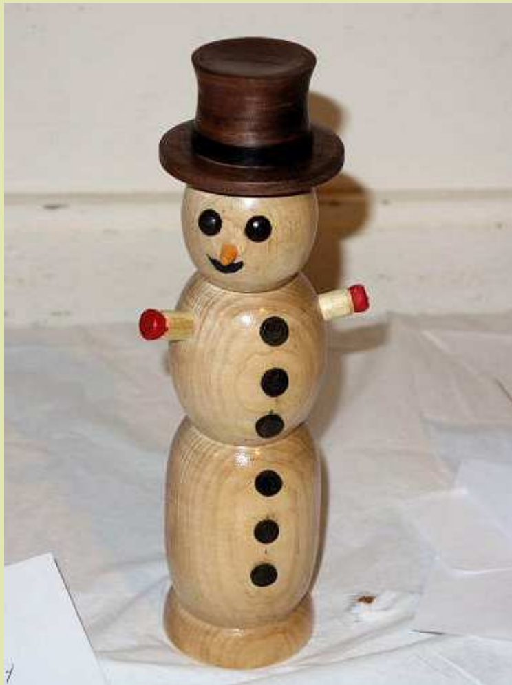
Snowman pepper grinder by Jim Oates