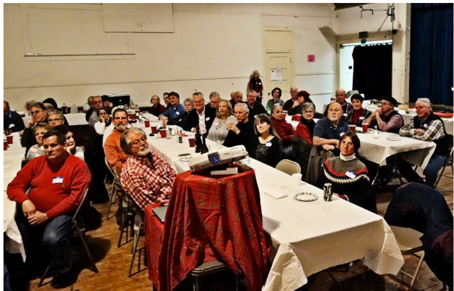
Middle R and R: Assembled members, spouses/significant others and families enjoying themselves