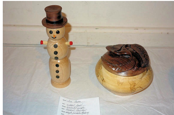
Lidded bowl made from walnut and maple, pepper grinder made from maple, walnut and ebony by Jim Oates