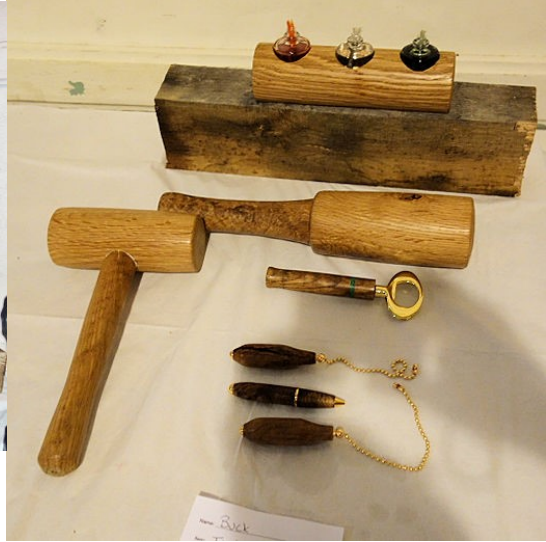
Buck Culver's pieces made from jack oak recovered from a truck stop.