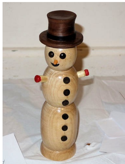
Right: Jim Oates maple snowman pepper mill