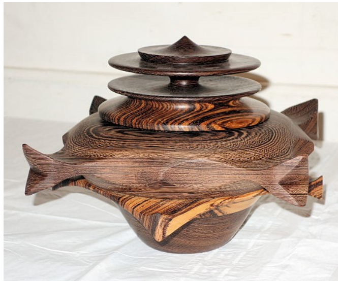
Lidded square fish vase made from African wenge and zebrano by Mike Sorge