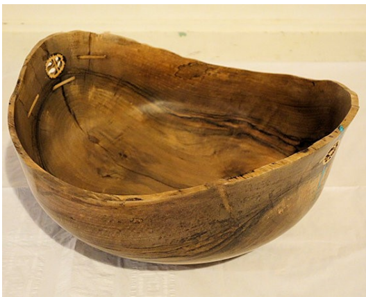
Tom Evans Walnut Bowl

Apologies to those whose pieces from Show & Tell are not included here. These photos are all that were available....Ed