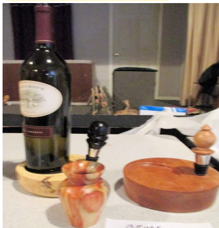
Bruce's wine coasters with Roger's box elder vessel caption

Bruce Stilwell showed two wine bottle coasters turned from cherry and box elder that also were made to support the bottle stoppers he had also turned. He also showed us a box elder vessel that he was concerned was losing color in spite of not being placed in the sun.