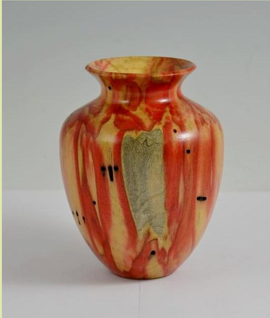
Roger Chandler's small box elder vessel