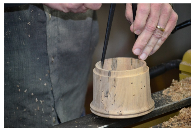
Verifying the base diameter.