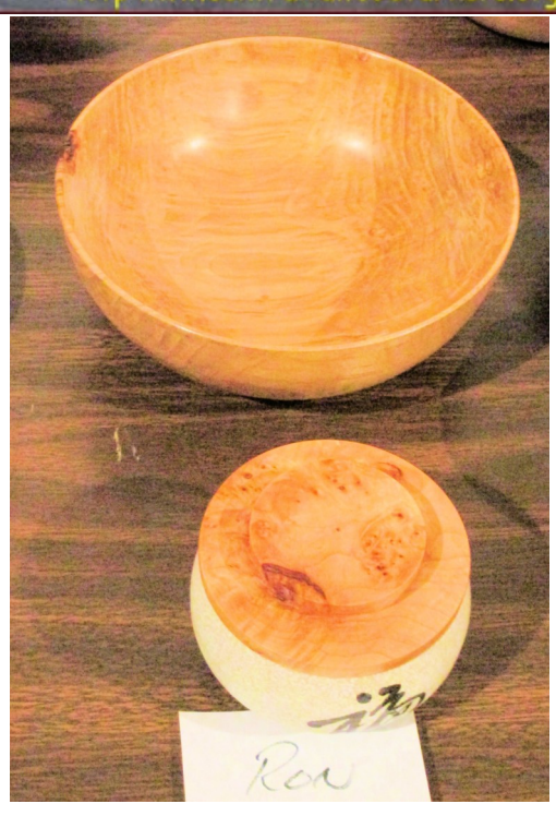
Ron Capps: lid for a salt container and a spalted maple bowl with a hand rubbed poly finish.