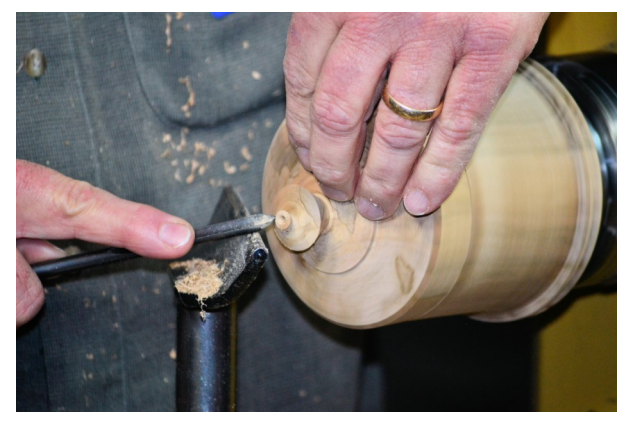
Above: Using the detail gouge to finish the lid.

turning the knob.