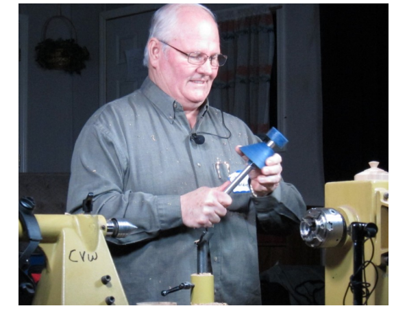
Above: Explaining the Rubber Chucky