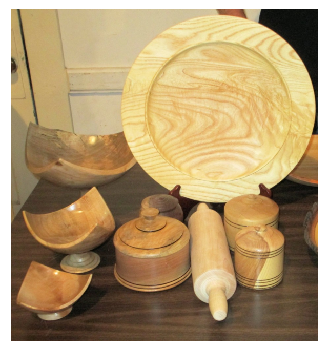
Roger Chandler's ash bowl, covered boxes, rolling pin and 3 sided footed bowls.