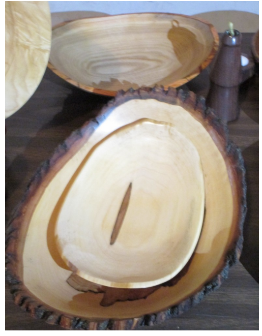
Starke Smith's coring system bowls (front), sassafras bowl and coke bottle from walnut