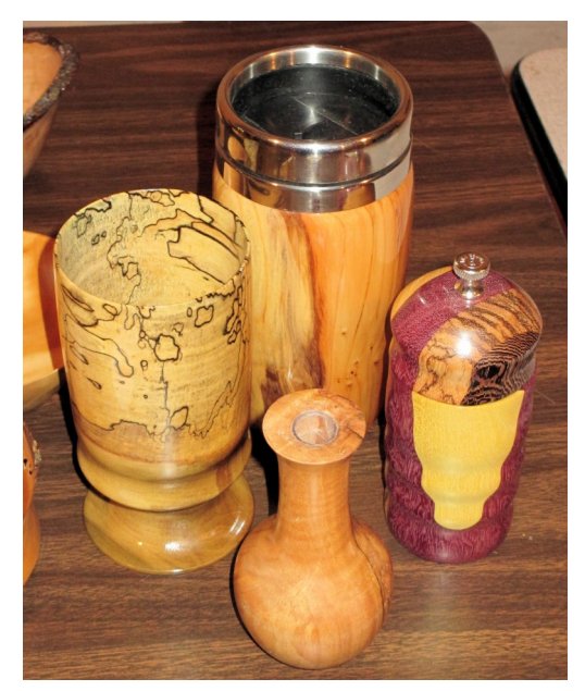
Jim Kueck showed two small Bradford pear bowls, a natural edge cherry bowl, a yew travel mug, a bud vase, a poplar goblet, and a pepper mill.