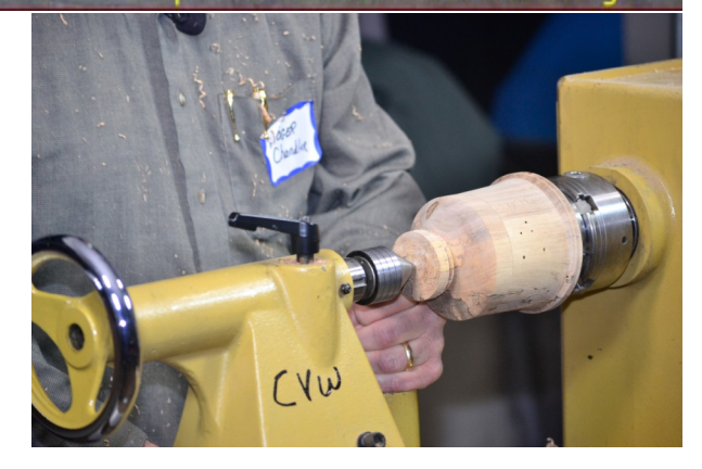
Left: Shaping \ the \ lid. \ Requires \ good \ tool \ control \ . Right: After \ reversing \ lid/base \ in \ chuck,

turning the knob.