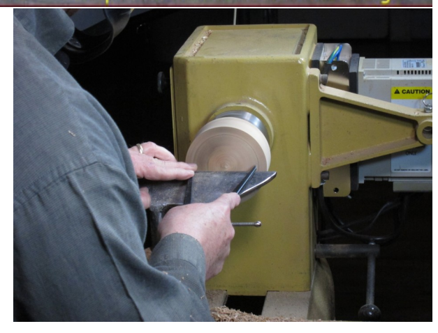
Left: Hollowing the base and, right: marking the base diameter on the lid