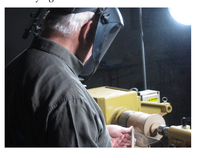
Turning the lid to match base.