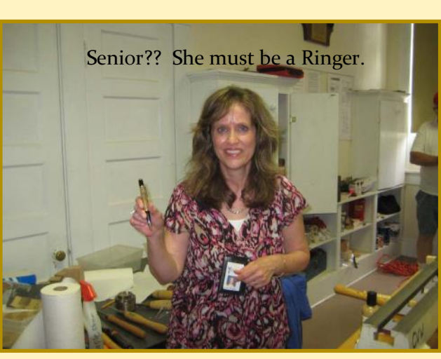
Crimora Ruritan Building www.centralvaturners.com