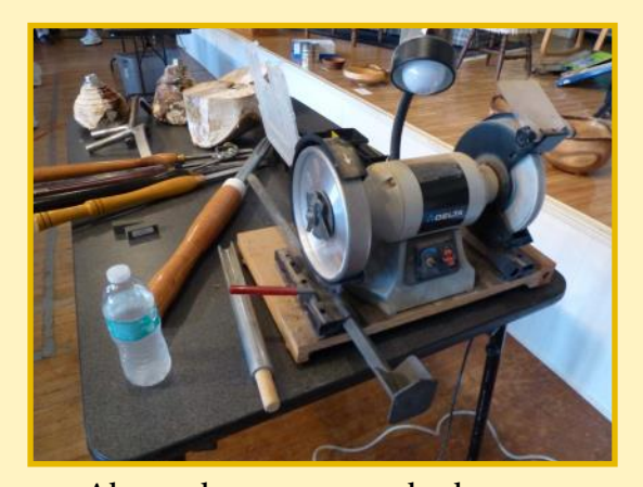
Always keep your tools sharp.