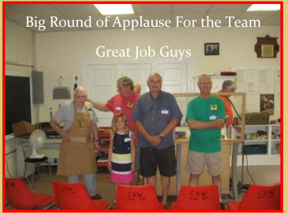
Crimora Ruritan Building www.centralvaturners.com