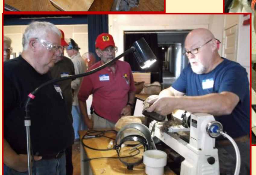
Central Virginia Wood Turners

Crimora Ruritan Building www.centralvaturners.com