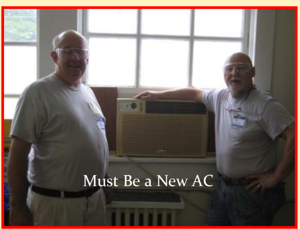
Crimora Ruritan Building www.centralvaturners.com