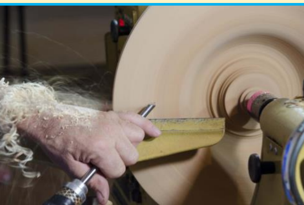
Kirk McCauley on a Powermatic 3520B