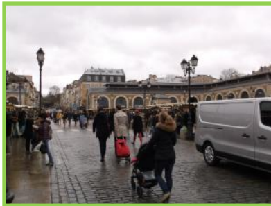
Market at Versailles