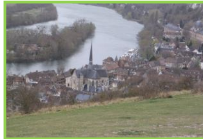
Town where Richard the Lion Heart's castle was.