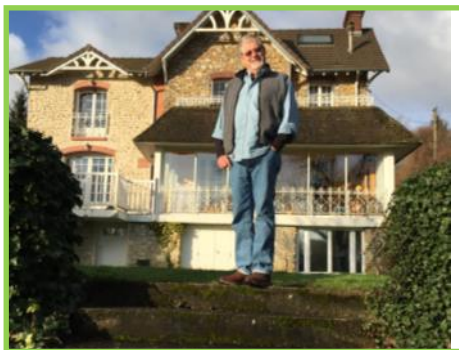
Where we stayed