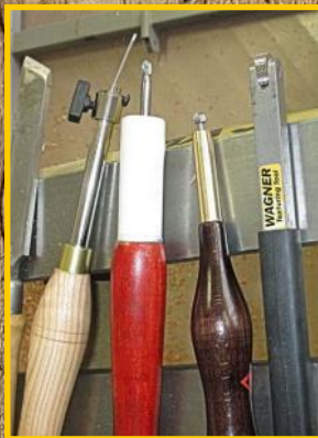
Texture Tools being tried