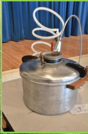
Ask Jim Oates about this contraption