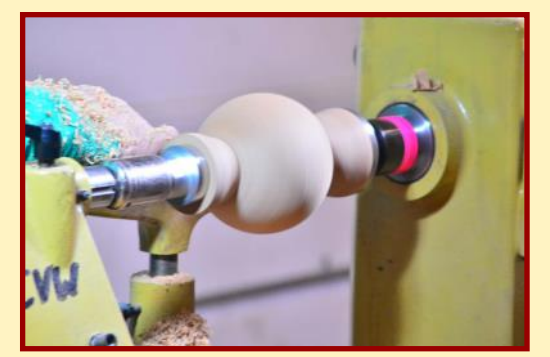
Crimora Ruritan Building www.centralvaturners.com