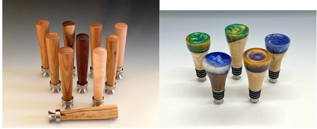
Total Boat resin and wood wine stoppers on Ruth Niles hardware.