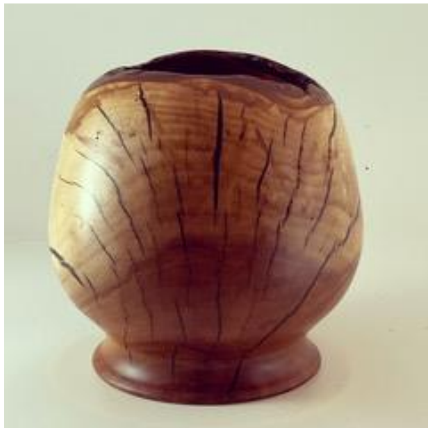
Weeping Cherry with black epoxy