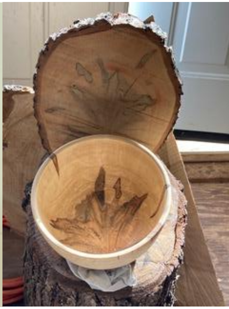
Sugar Maple bowl