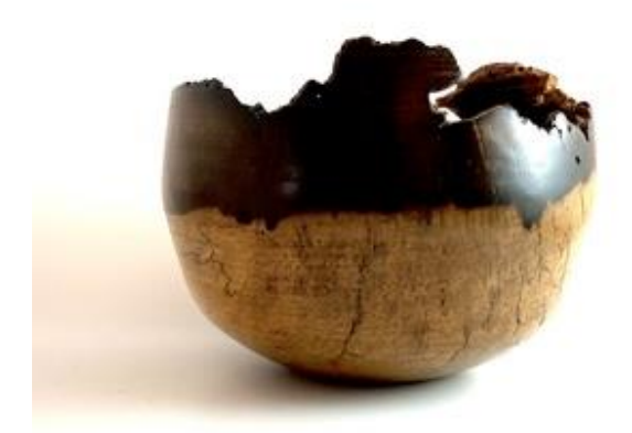
Spalted Tulip Tree bowl with natural edge