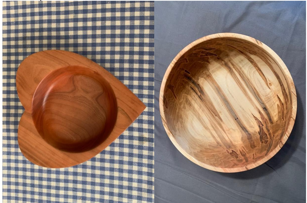
Cherry Heart Bowl