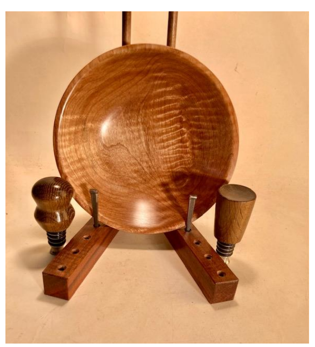
Tiger Maple dish and two fumed White Oak bottle stoppers