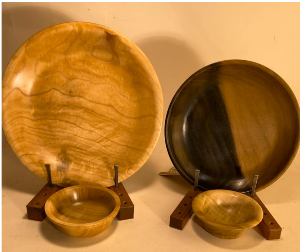
Figured Poplar, mineraled poplar and Two small dishes of poplar crotch