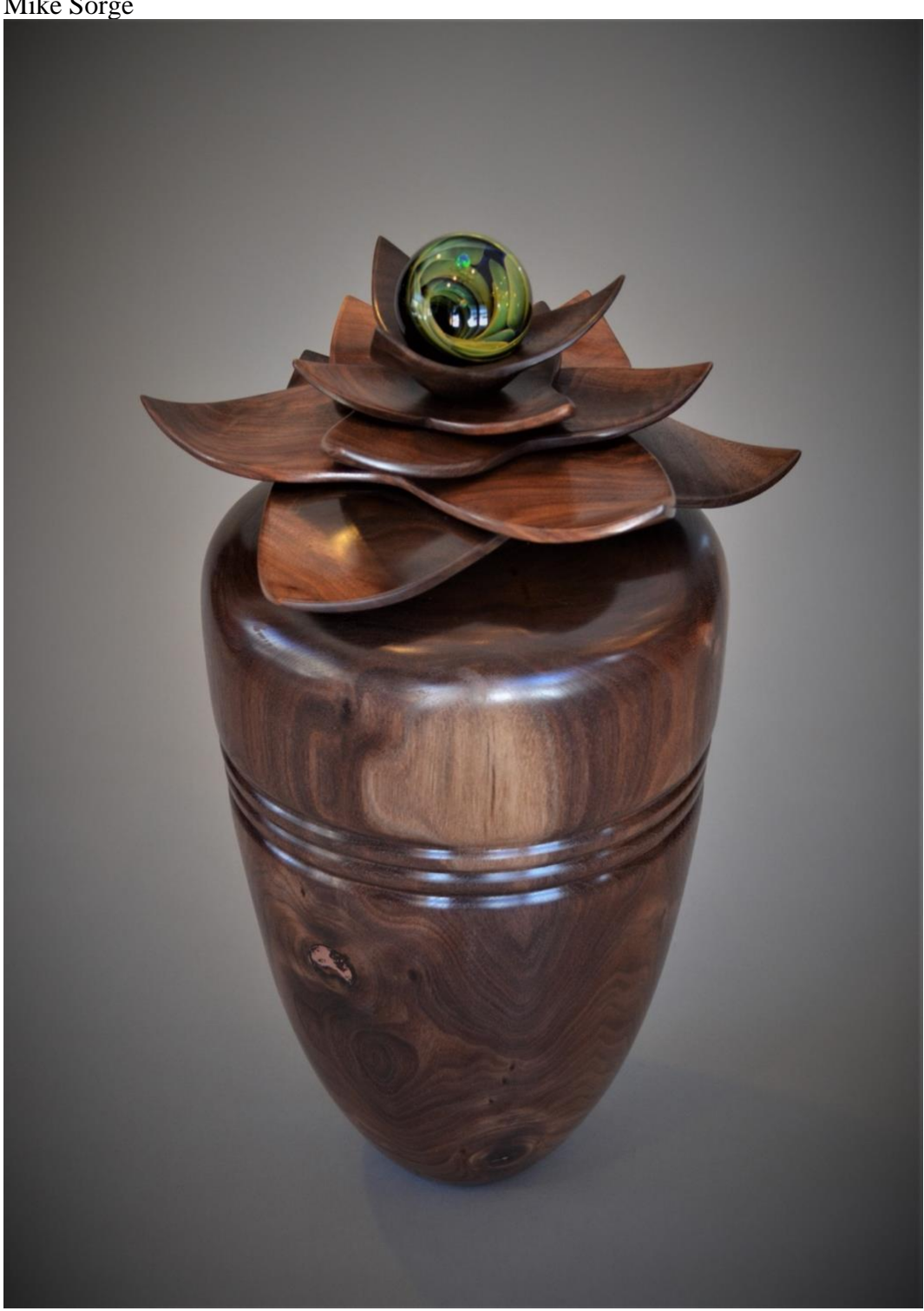
"Sorgente Blossom" - Black Walnut & Glass Sphere, 18" high x 10" diameter (Sorgente definition = origin, fountainhead, wellspring, source of inspiration...)