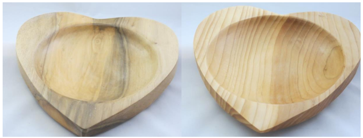
Montpelier Black Gum