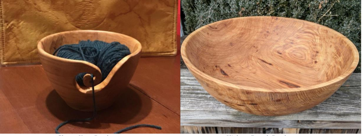
Cherry Yarn Bowl