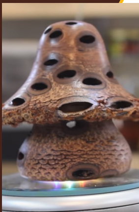
Banksia Seed Pod Mushroom Box