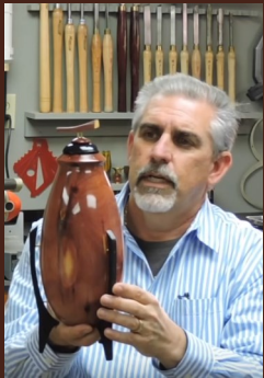
Hollow Form Vessel