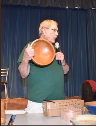
Look, no hole!