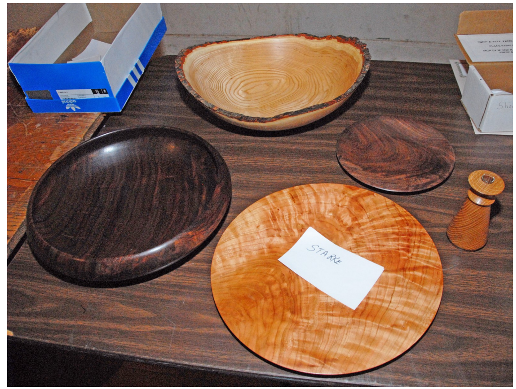
Starke Smith 's walnut bowl from a stump, Chinese mahogany platter, natural edge bowl, and bud vase from the Stonewall Jackson Prayer Tree

Kirk McCauley's corian bowl, black soapstone cheese boards, and soapstone "ice cubes."