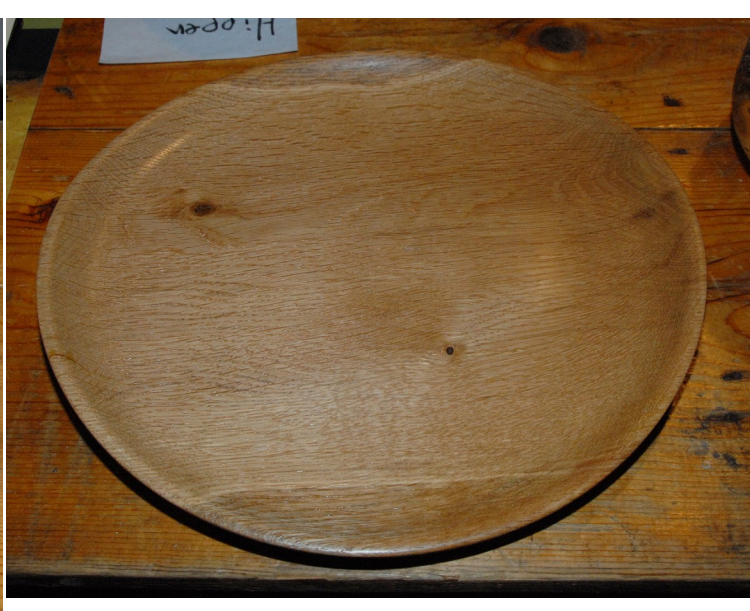
Dennis Hippen's three pieces from chestnut oak