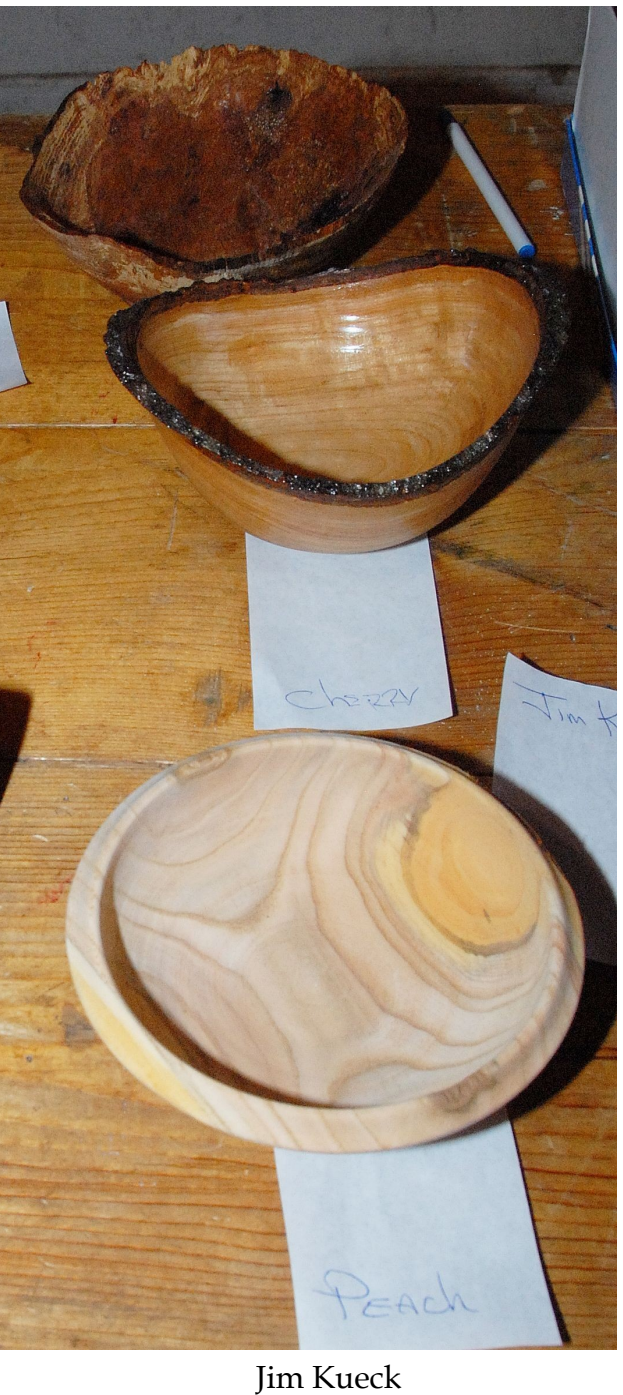
Black oak bowl natural edge cherry bowl peach bowl