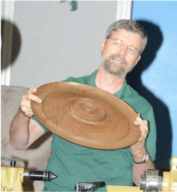
Large footed platter