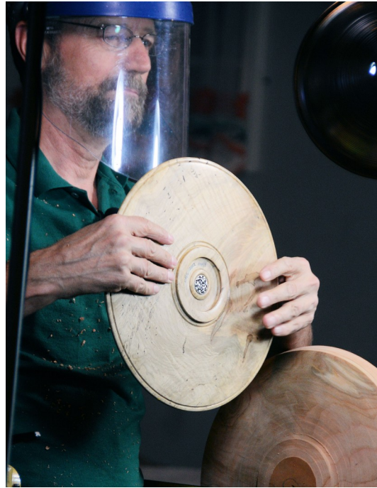
A possible choice for the foot. Another possibility: a multi-axis turned foot .