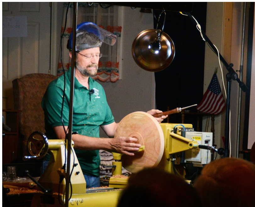
Sanding the bottom before starting on the top of the platter. He sands ambrosia maple using Enduro-var in a sequence of sand, Enduro-var, sand, Enduro-var, through 8 grits ending at 400 grit.