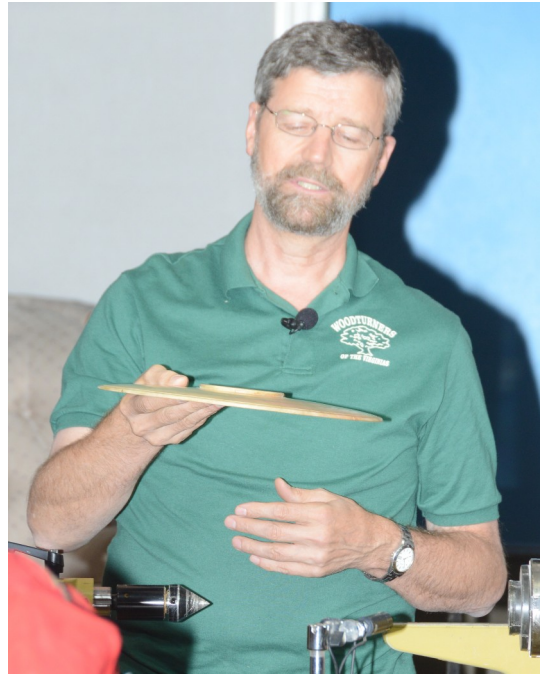
Thin footed platter