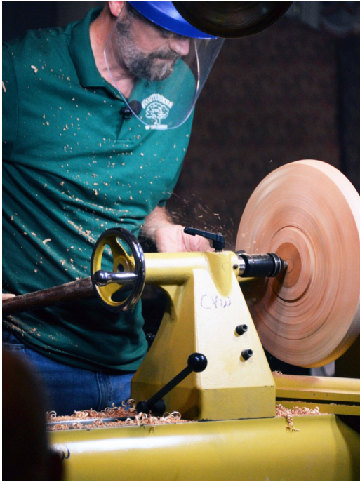
Cutting a recess to reverse chuck the piece