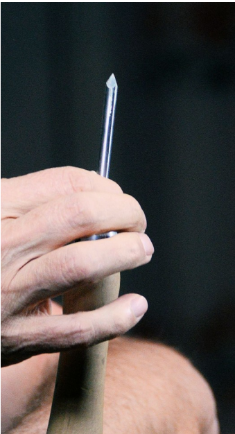
Ervin's favorite tool (self-made) for making beads – a 3 sided pyramid point tool.