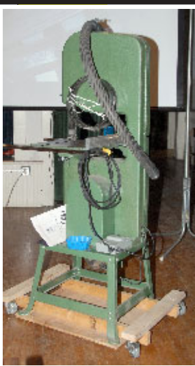
Grizzly band saw donated by Hal Green

Several very nice pieces were on display for Show & Tell - but no Tell