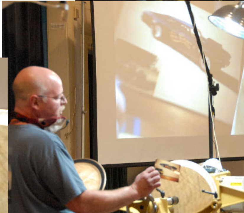
Transferring images from pictures to turning