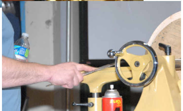
Smoothing the tool rest upper surface prior to starting to turn is important