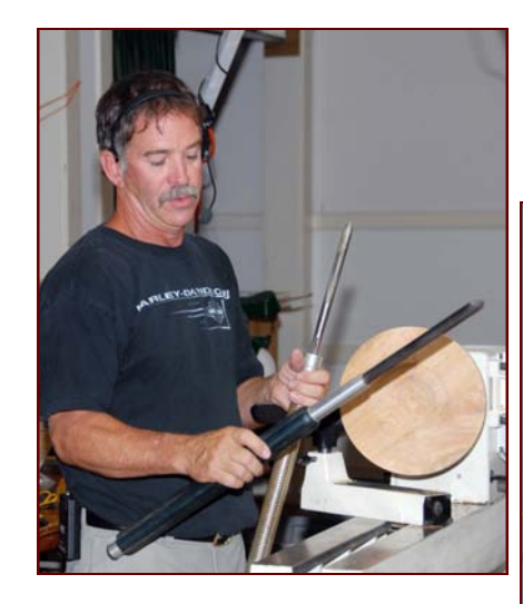
Getting the outside right

The next Club meeting will be Tuesday September 15, 2009 from 6:30 pm to 9:00 pm.