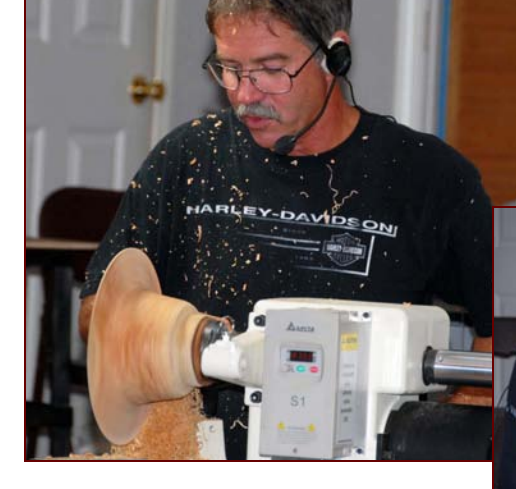
Making sure the inside is thin enough