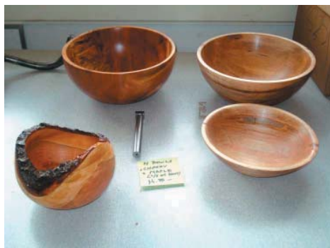
Bowls by HB Salomon