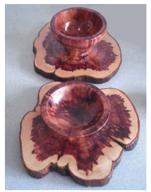
Goblets on a natural edge base made from the base of a large red cedar by Don Voas.