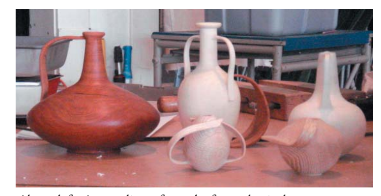
Above left: A sampling of vessels, from classical to contemporary, illustrate some of the variety that can be achieved. Right: Tom uses a variety of tools to complete the shape.

Tom Crabb creates curious turned vessels with a twist. These objects are each created from a single piece of wood and incorporate handles, stands, and curious visual puzzles. Tom explained the theory behind wood bending. After turning his basic shape, he goes through a number of steps to create the appendages and then prepare these appendages for bending. He makes forms to stabilize and set the shape. The bending actually occurs through the use of heat and water. The object may be steamed or boiled.