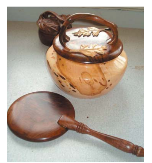
Lidded Vessels and Mirror by Jim Oates