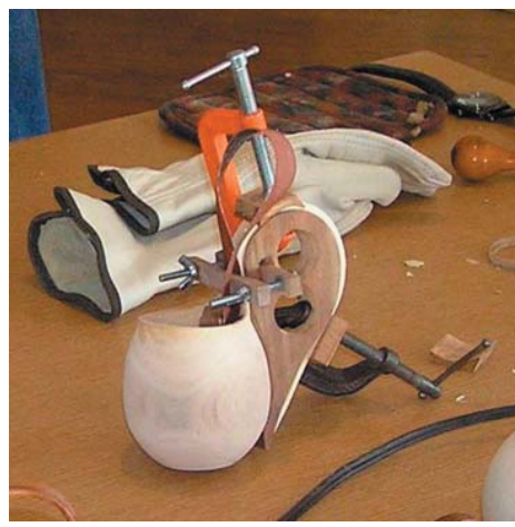
Item clamped and drying. The back strap has been released in this image.

This ranking represents the results from one evaluation; variation in the results can be expected from tree to tree and site to site.