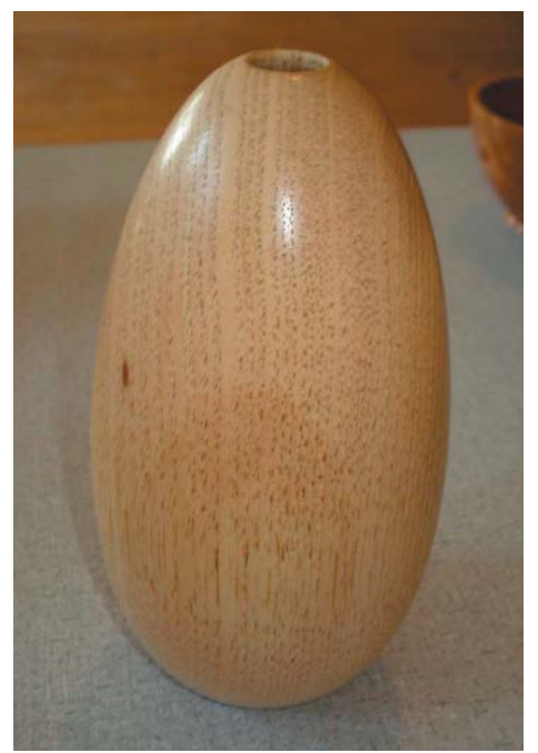
Butternut vessel brought in by Don Voas