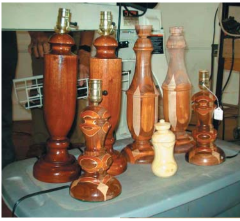
Above: A sampling of lamps, some of which are segmented