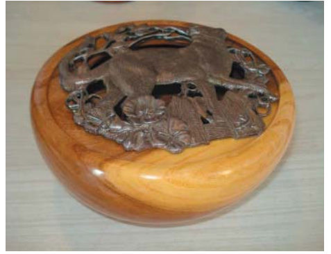
Lidded box by Tom Evans