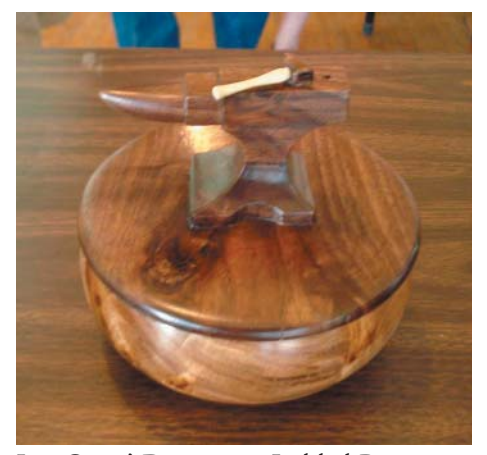
Jim Oates' Decorative Lidded Box