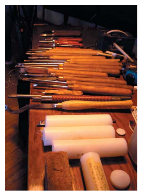
Ron's tools on presentation bench