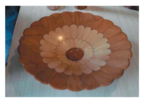
Jim Higgins' pieced bowl constructed from a variety of woods