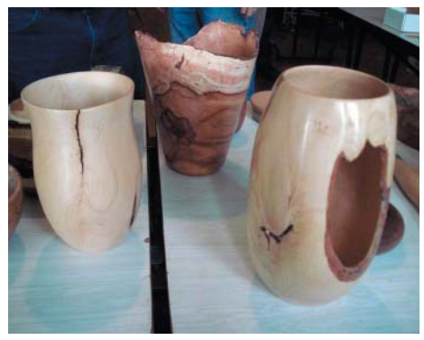
Tom Evans' three vessels