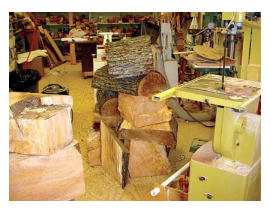
Bert Smith's typical day at the bandsaw