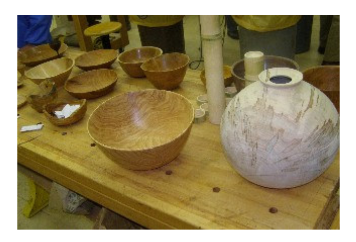
Our show-n-tell included a very impressive closed mouth bowl by Kirk McCauley from Ambrosia Maple plus other great pieces