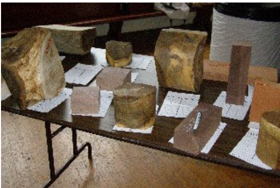
Our Silent Auction offerings for the month