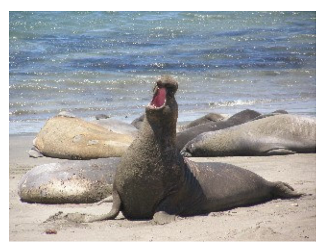
Since we have no pictures from last meeting, I've included some from our trip up the coast of CA. These are male Elephant Seals (3-5 thousand pounds).