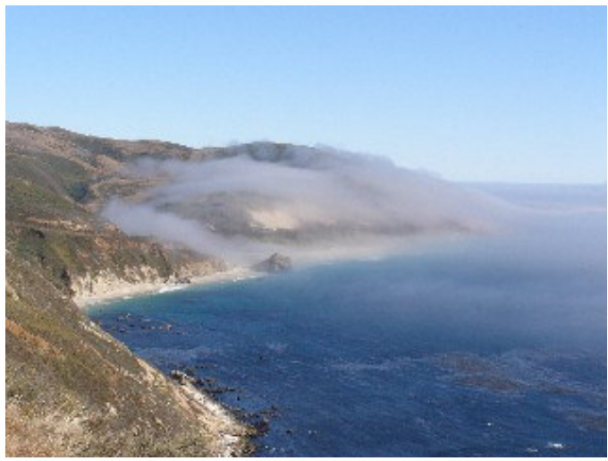
Low fog along the coast between San Simeon and Carmel and a shot with no fog.