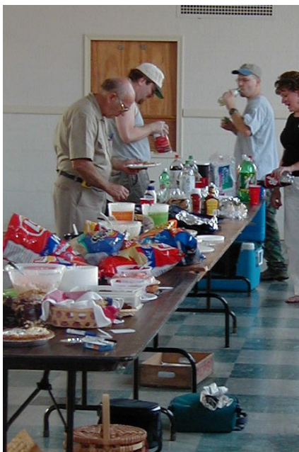
The Food Line