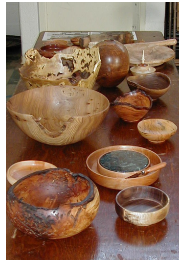
Some of the show-and-tell