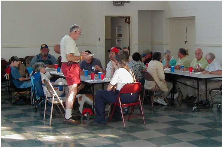
Nice legs Stark