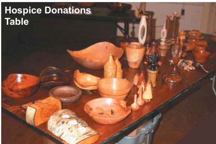
Hospice Donations Table