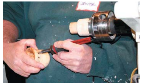
After he parts off the piece he burns in little stars around the ornament.