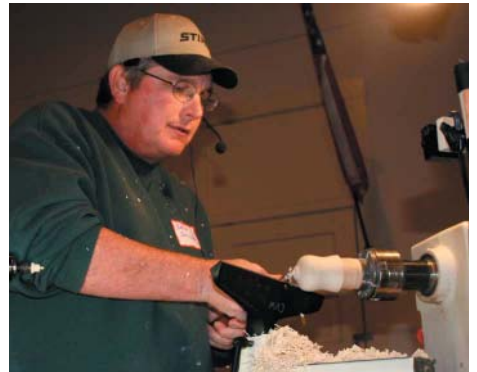
He shapes the wood into a bell exterior.