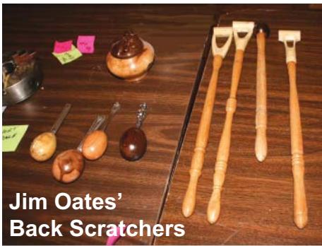
Jim Oates' Back Scratchers