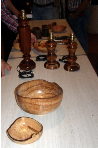
Ron Dearing's two Maple bowls are in the foreground and Miles Everard's lamps in the middle. (Editor's note: Not a very good picture of the rest. Sorry about that.)