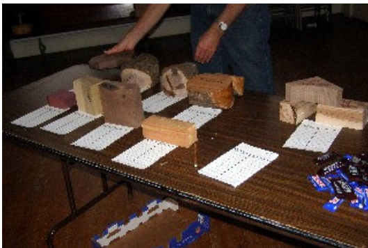
Our Silent Auction offerings for the month